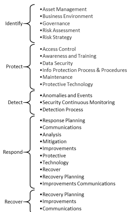
Fig. 1 NIST Cybersecurity Assessment Framework [6]

The NIST [5, 6] guides organizations to evaluate and enhance their capability to identify, protect, detect, respond, and recover from cybersecurity attacks. This framework acts as a guide for assessing and improving the cybersecurity strategy.