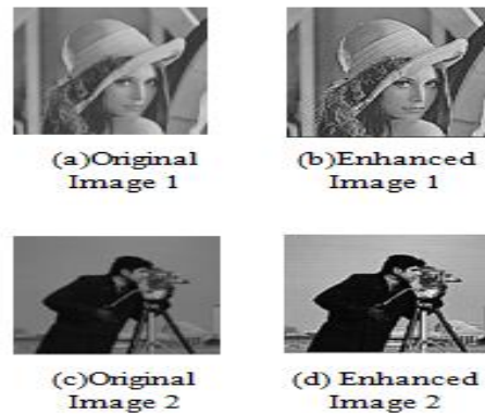
Figure 4 Output of employing Unsharpmasking Enhancement

f is that the given image. y is that the sharpened image and g spoken be the gradient image. a is spoken be the distinction constant bigger than zero. Figure four depicts the sweetening carried by using unsharpmasking[16].