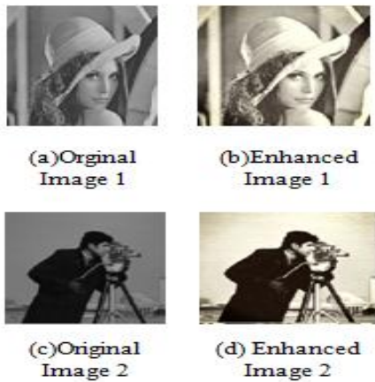
Figure 3 Output of Homomorphic Filter Enhancement