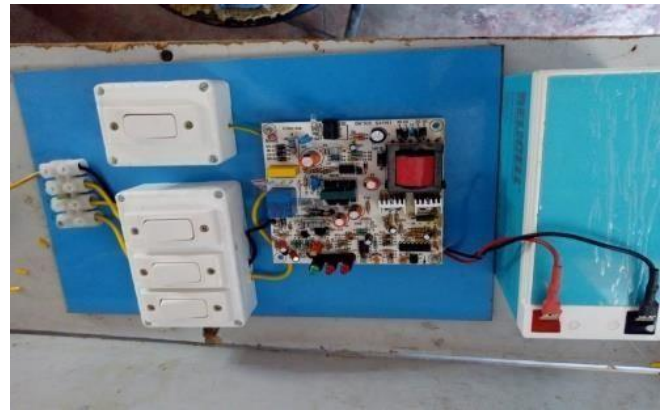
Fig. (ii) Battery with Inverter Ref [4]

The thing made by combining two or more different elements is refer as hybridization. We need hybridization for increasing output, fulfilling demand of consumer and providing uninterrupted power supply. This methodology is on ideal various in areas wherever wind rate 5.6m/s is out there. because the wind doesn't blow all the time nor will sun shine any time, star and alternative energy alone are poor power sources. Coupling of photo voltaic and alternative energy sources in conjunction with storage batteries to hide the periods of your time while not sun or wind provides a sensible type of power generation.