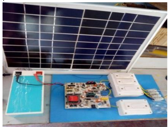
Fig. (iii) Photovoltaic Module and Battery with Inverter

The system creates a complete energy sources that's each dependable and consistent that is named the solar-wind hybrid system. For the most part, these sun powered radiation cross breed frameworks are able to do little capacities. The everyday power generation capacities of photo voltaic and wind hybrid system are within the vary from 1kw to 10kw