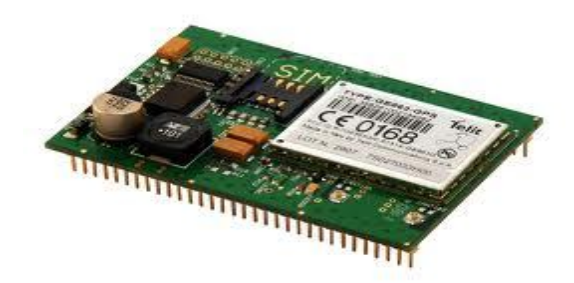
Fig 2 GSM Module

GSM underpins voice calls and information exchange it accelerates to the 9.6 Kbits, collected with the communication of SMS (Short Message Service). GSM works in the 900MHz and 1.8GHz groups in the Europe and the 1.9GHz and 850MHz groups in the USA. The 850MHz band is additionally utilized for GSM and 3G in Australia, Canada and numerous South American nations. Because of the orchestrated range transverse over the majority of the globe, GSM's worldwide meandering capacity enables clients to get to different managements when voyaging abroad same from a living spot. This gives purchasers a similar number of