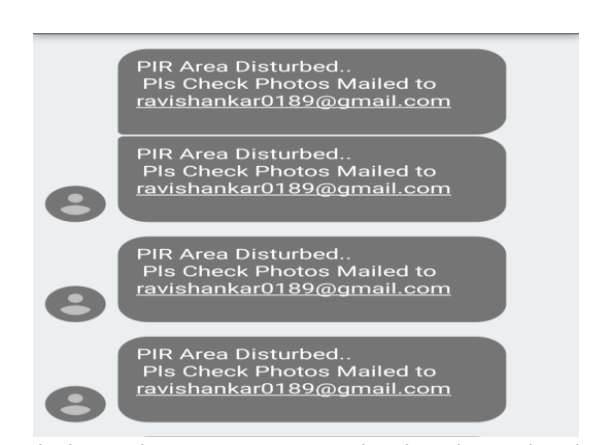
Fig 9 Received message when in direction object is detected