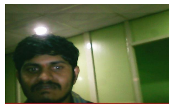
Fig 6 Detecting the moving object in direction one

This system is essentially tested and the results are attained magnificently Consequences of the scheme are as trails.