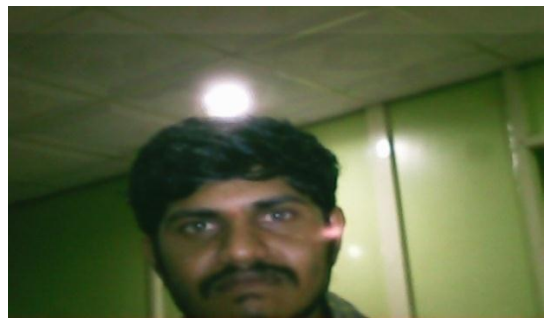
Fig 7 Detecting the moving object in direction two