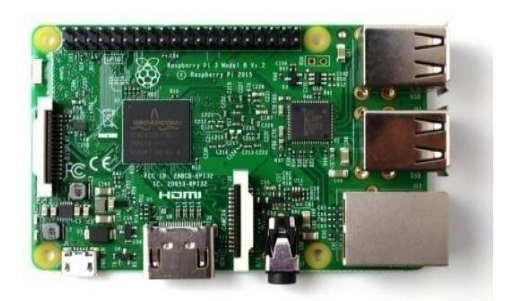
Fig 3 RaspberryPI 3 Board

The RaspberryPi 3 ModelB is available and it's astounding! With an updated ARMv7 more than two focus mainframe, and a full GB of RAM, this compact PC has stimulated from existence a 'toy PC' to a veritable work area PC. The tremendous overhaul is a interchange from the BCM2836 (single focus ARMv6) to BCM2837 (quad focus ARMv7).