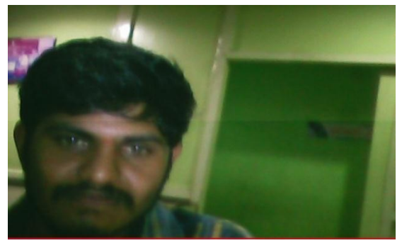
Fig 8 Detecting the moving object in direction three