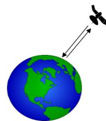
Fig.2 Active remote sensing

The main focus is on spatial resolution which brings out the smallest discernible information about the object by the sensor’s instantaneous field of view (IFOV). Depending on this pixel resolution the data contents are stored. The current developing technologies have been producing considerably good spatial resolution imagery with each objects holding a specific number of pixels. These objects when placed closer to each other may collide appearing as a single image. In order to enforce anti-collision mechanism special types of sensors have been used. These sensors imbibe the signals and accumulates it in the raster. Each cells in these raster’s constitute a pixel. More the pixels, higher is the level of information collected [5]. The received signals are quantified into various phases each with a different band.