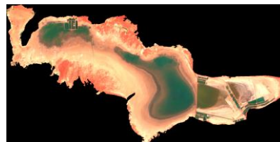
Fig. 4. False color composite of a water body

The well known spectral indices are Normalized Difference Vegetation Index (NDVI) which consider Green and Red bands of details for classifying the vegetation / agriculture products and Normalized Difference Water Index (NDWI) which considers Green and Near Infra Red Bands for classifying the available water bodies from the cluster of spatial objects in the images. The False Color Composite (FCC) generation through specific channel selection and composition as shown in Fig.4.